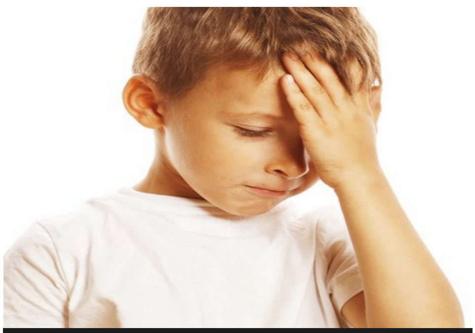
Sick day management is an important part of your overall ketogenic diet plan.

Please check with your dietitian to include these recipes into your individualized plan.