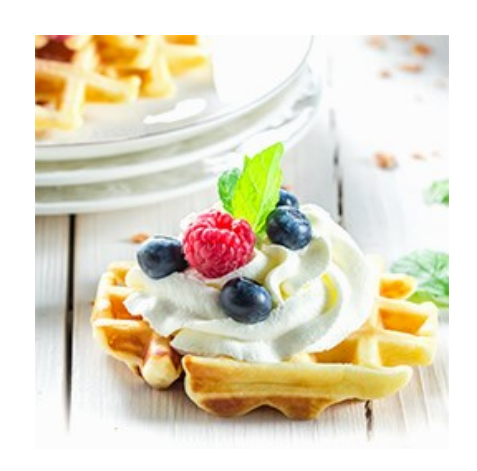
Ordering information can be found here.